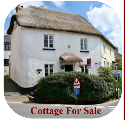
Cottage For Sale

Covering : Malvern, Hereford, Worcester and surrounding Areas