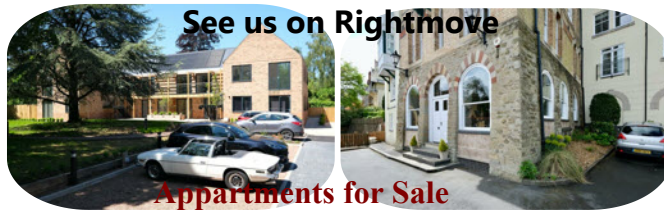
See us on Rightmove