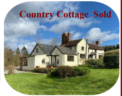
Country Cottage Sold